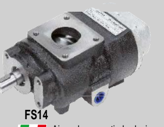
Air-ends are entirely designed and made in Italy, just as the intake regulator and separator block with minimum pressure valve.